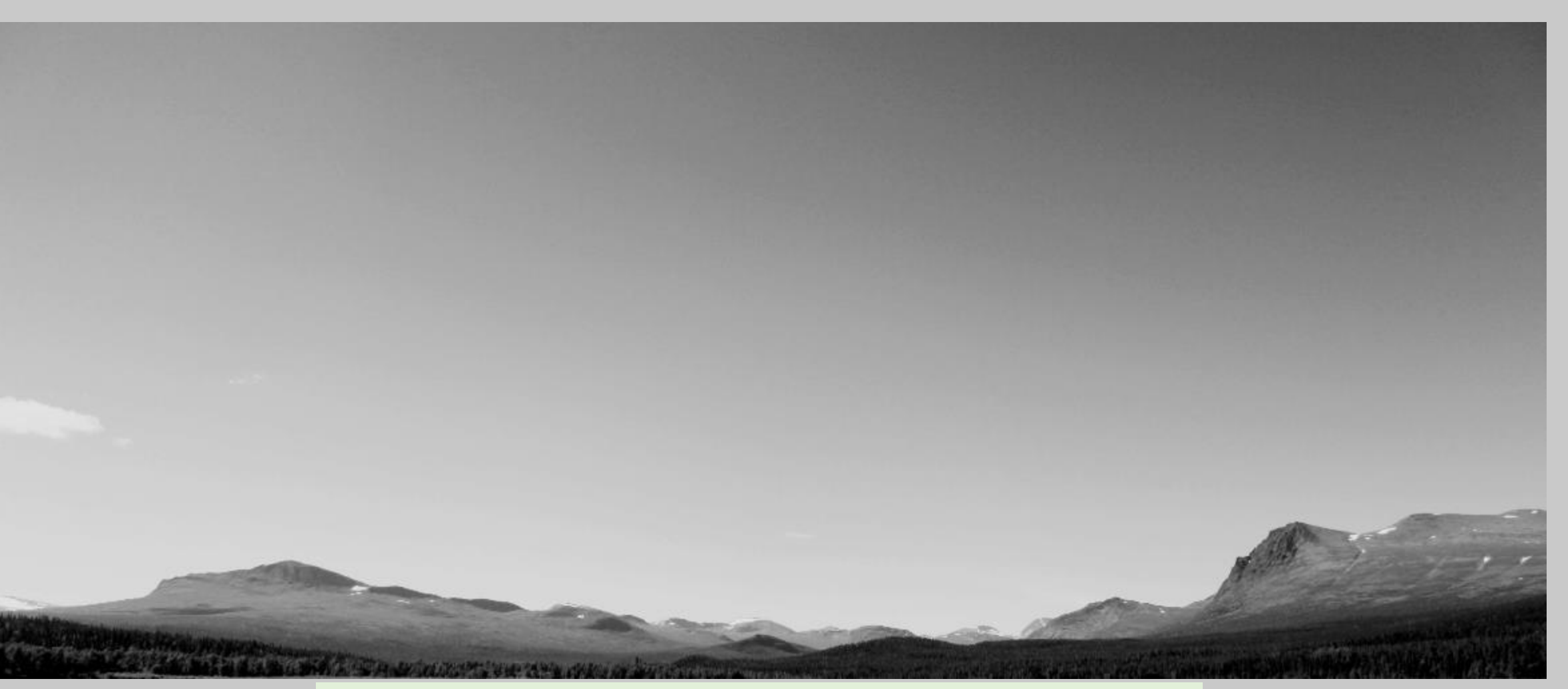
Figure 6: Black and White Photographic piece 'Landscape 7'