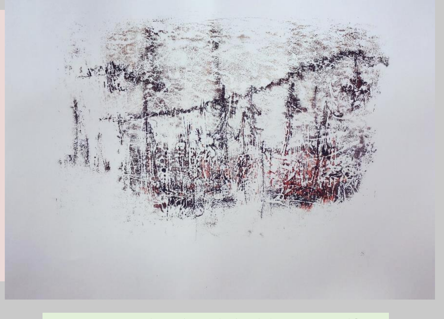
Fgure 2: Monoprint using printing ink on A3 cartridge paper of Sarek National Park Mountain Range

'a mono-print is a one-off image made typically by transferring ink from a smooth surface onto a sheet of paper.'